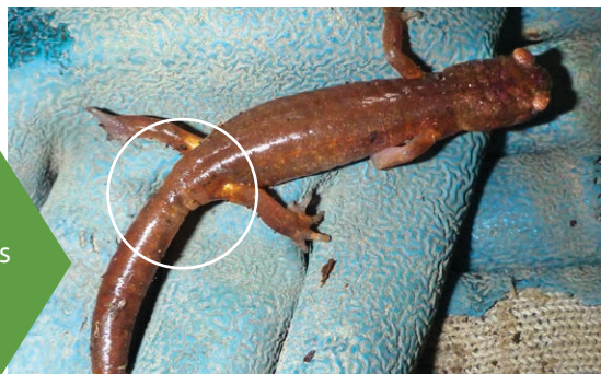
Pinched base of tail