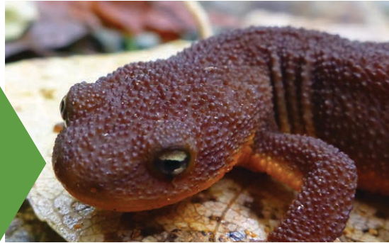
Thick, bumpy skin