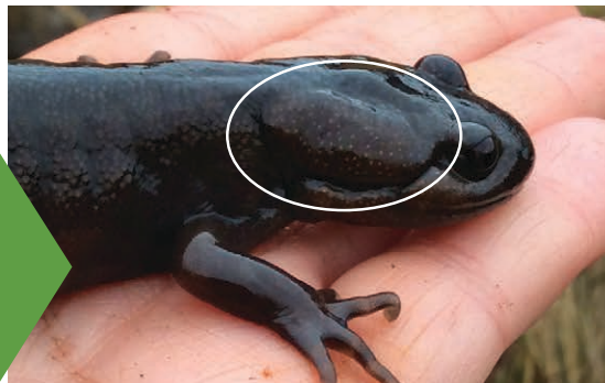
Large glands behind the eyes