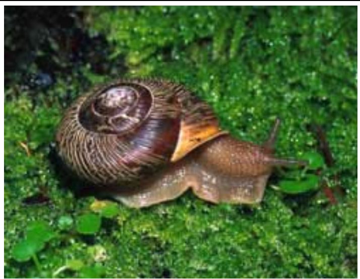
Figure 2: Adult Oregon Forestsnail.

The Oregon Forestsnail is a large snail with adult shell diameter about 28–35 mm. Diagnostic features include a globular, straw-yellow to light brown shell with fine lines and an opening with a white, thickened rim that flares outward. The outer layer of the shell is often partially worn off, exposing a whitish under-layer. The animal itself is pale brown. Consult guidebooks (e.g., Forsyth 2004) for a detailed description of this and other species of gastropods.