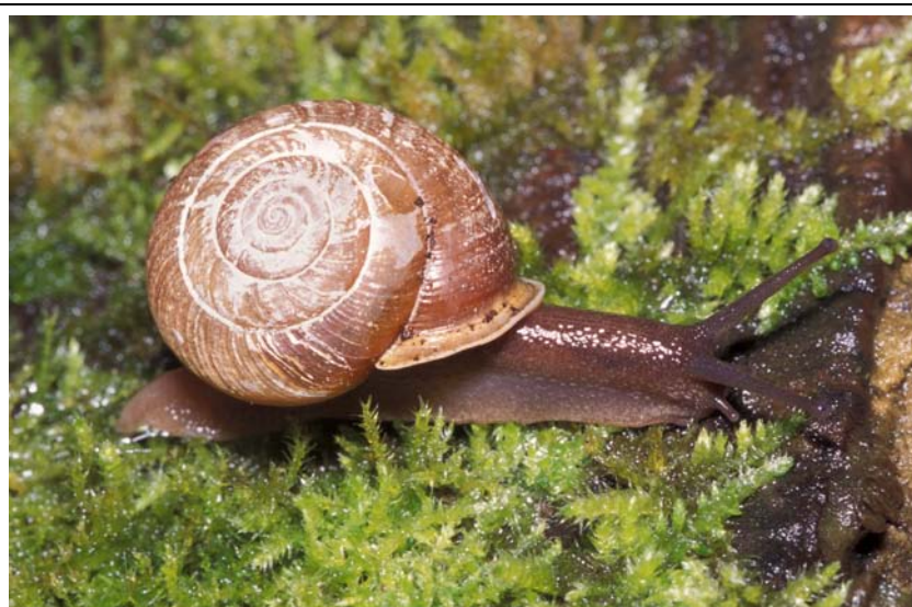
Figure 2: Adult Puget Oregonian Snail.

Many other species of terrestrial gastropods occupy similar habitats as the Oregon Forestsnail and co-occur with this species. In British Columbia, the Puget Oregonian Snail is known from only old records and is presumed to be extirpated (COSEWIC 2000b); however, pockets of this large snail could still exist in the province, and the species should be included in the list of target species in surveys of Oregon Forestsnail habitats. Other large native snails, such as Pacific Sideband ( Monadenia fidelis ), Northwest Hesperian ( Vespericola columbianus ), and lancetooth snails ( Haplotrema and Ancotrema species), and numerous small snails with adult shell diameter less than 5 mm commonly occur in the habitats occupied by the Oregon Forestsnail; of these small snails, the Western Thorn ( Carychium occidentale ) is on the BC blue-list of species at risk. COSEWIC-listed slugs (Dromedary Jumping-slug, Warty Jumping-slug, Blue-grey Taildropper) are known from southern Vancouver Island only and have not been reported from the Lower Mainland to date; these species are not known to co-occur with the Oregon Forestsnail.