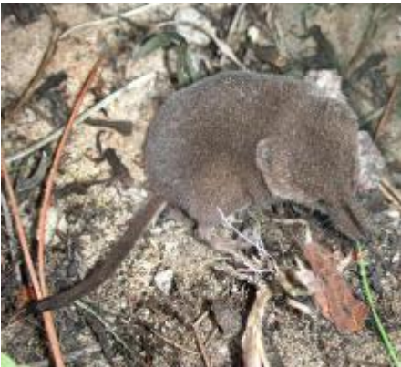
Cinereus Shrew