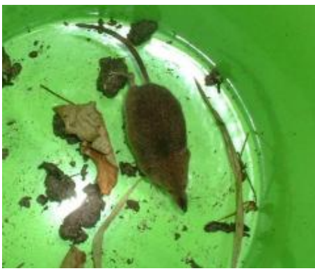
Cinereus Shrew Pamela Zevit 2005