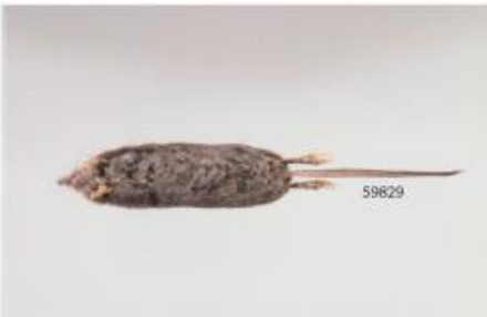
Olympic Shrew (ventral view) R&V Rausch 2008