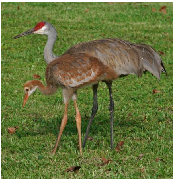
Sandhill Crane Adult and "colt"

Great Blue Heron are often mistakenly referred to as a “cranes” due to the fact that the closest look alike in size is the Sandhill Crane (the only species of crane in BC). Unlike Great Blue Heron, Sandhill Crane have a large patch of bare, red skin above the eye, fly with a fully extended neck and nest on the ground. Cranes also have a distinct “bustle” or group of large curved feathers over the lower back and tail area.