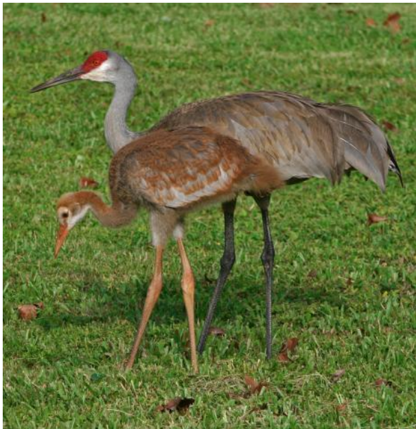
Sandhill Crane Adult and "colt" Tom Freidel Flickr

Great Blue Heron are often mistakenly referred to as a “cranes” due to the fact that the closest look alike in size is the Sandhill Crane (the only species of crane in BC). Unlike Great Blue Heron, Sandhill Crane have a large patch of bare, red skin above the eye, fly with a fully extended neck and nest on the ground. Cranes also have a distinct “bustle” or group of large curved feathers over the lower back and tail area.