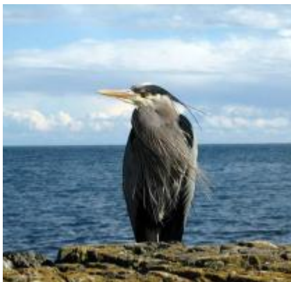
Adult Great Blue Heron in full breeding plumage Cory Melchior