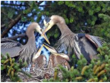
Heron Family