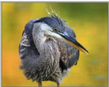
Juvenile Great blue Heron winnu (Flickr)