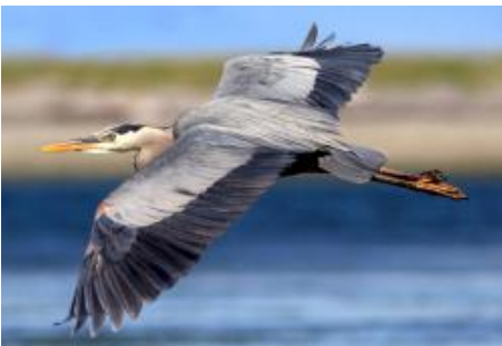
Adult Great Blue Heron

Great Blue Heron are a member of the family Ardeidae (Hérons, Egrets and Bitterns), represented by ~64 species globally. Although herons resemble birds such as cranes, they are not in the same family. Two subspecies occur in BC, the coastal fannini ssp. and the interior herodias ssp.