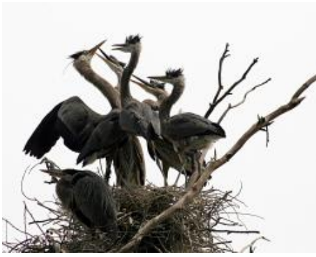
Great Blue Heron chicks on the nest